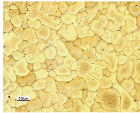
CDS (globular microstructure)