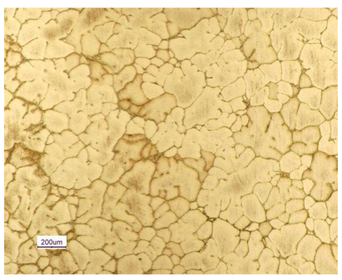
Conventional (dendritic microstructure)

Microstructures of 206 alloy cast via conventional casting and the CDS process.