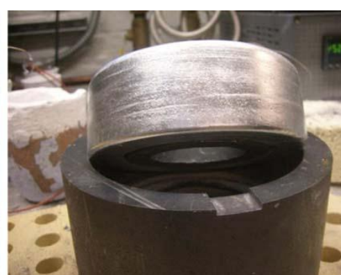
CDS (Free of hot-tears)